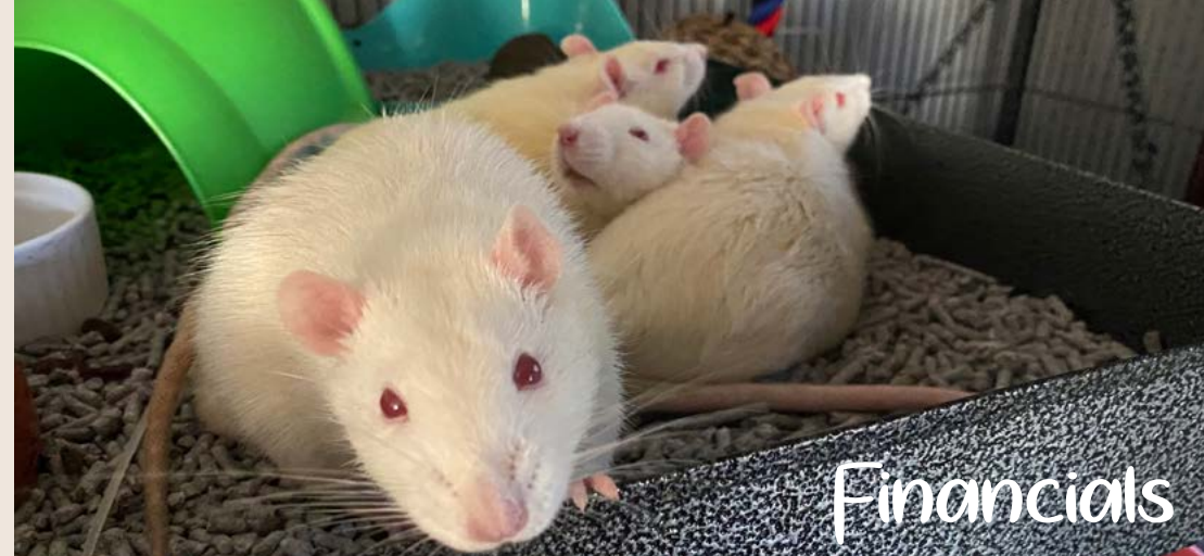
Annual Income Statement - 1 July 2020-30 June 2021